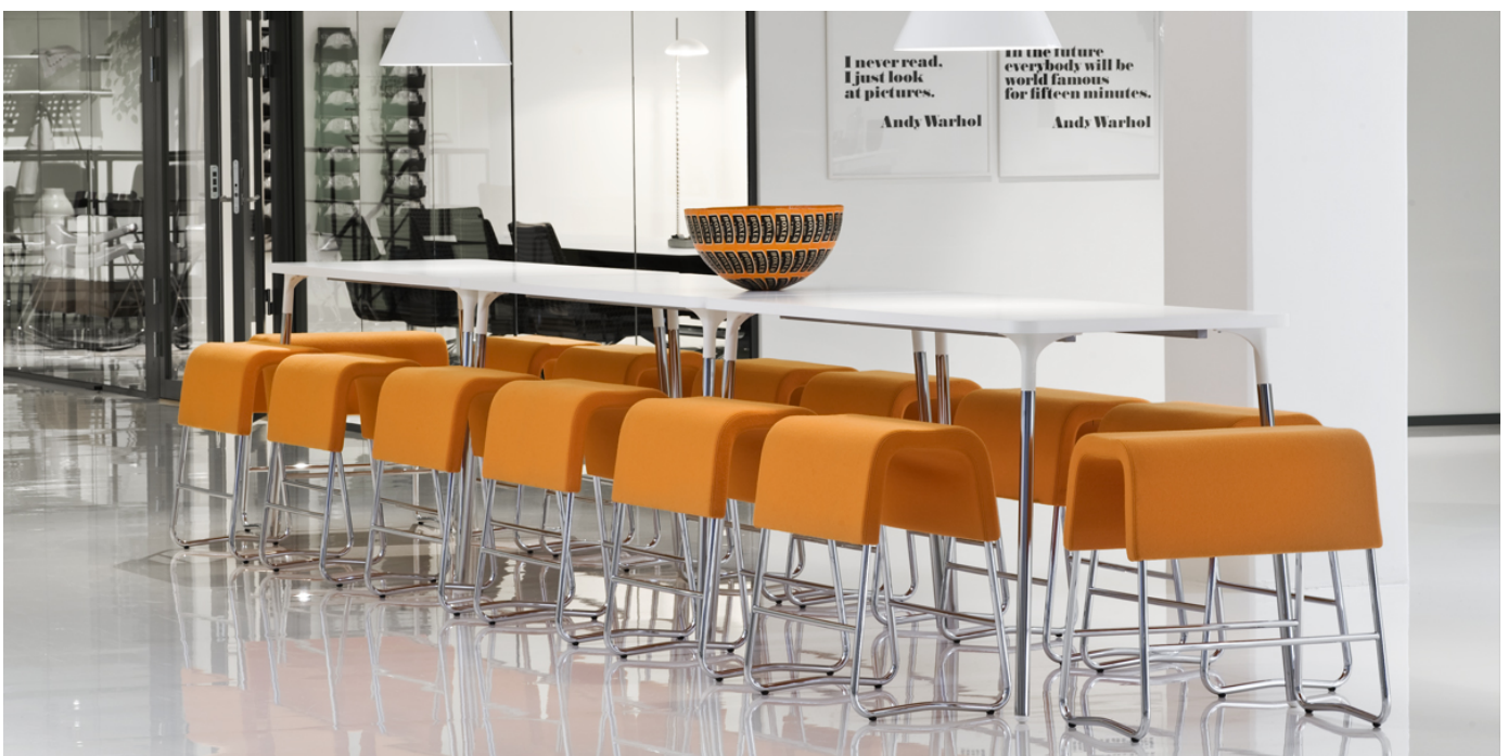
Plint bar stools (FSC and Möbelfakta labelled) and Silent Whisper tables (Möbelfakta labelled).